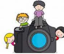
Picture Retake Day

Fall Picture Retake day will be held on Wednesday, November 3.